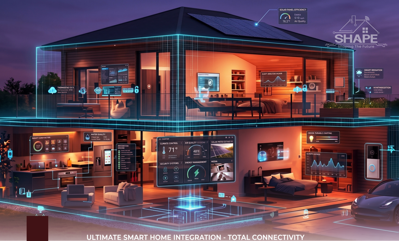
ULTIMATE SMART HOME INTEGRATION - TOTAL CONNECTIVITY